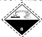
US DOT SYMBOLS