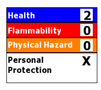
HMIS RATINGS (0-4)