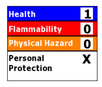
HMIS RATINGS (0-4)